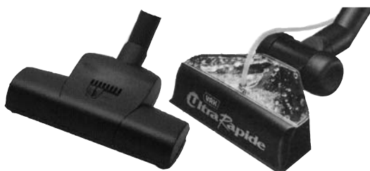
Floor Tools / Rods