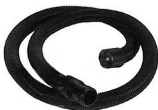
Hoses & B.E.P